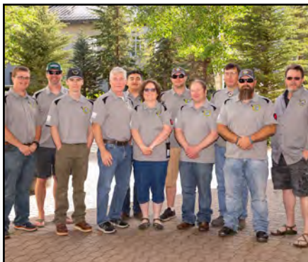
Westmoreland Rosebud Mining LLC