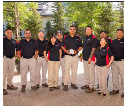
Westmoreland San Juan Mining LLC