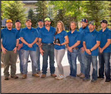
Falkirk Mining Company