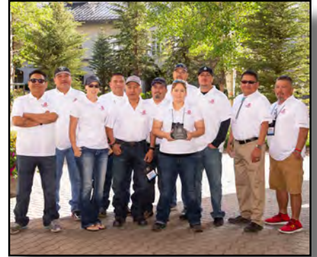
North American Coal - Bisti Fuels