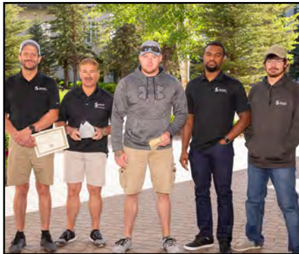
Solvay Chemicals, Inc.