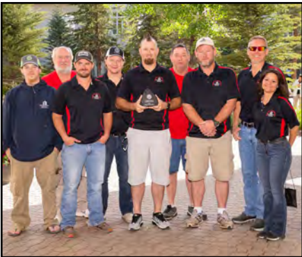
North American Coal - Sabine Mine