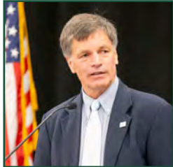
Governor Mark Gordon State of Wyoming

The technical sessions provided some of the best speakers we have had, and provided up to date information about the industry. A link to those presentations was sent to all attendees and will be on the website in the member area. Please contact the office if you have any questions about the material presented.