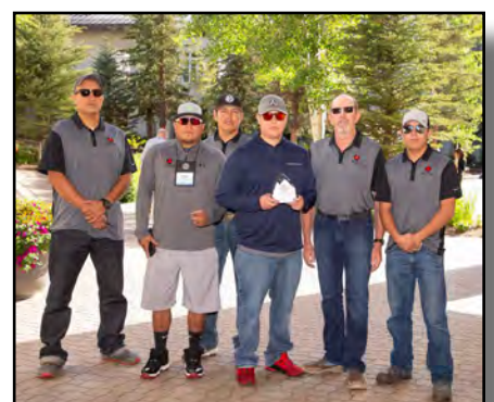
Westmoreland Absaloka Mining LLC