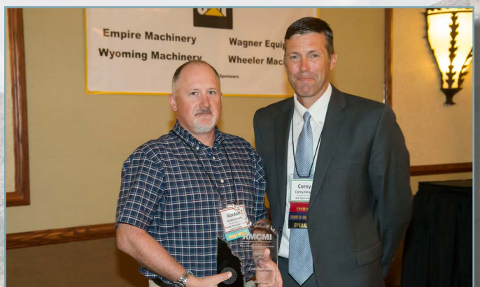
Small Surface Mine Coal Creek Mine