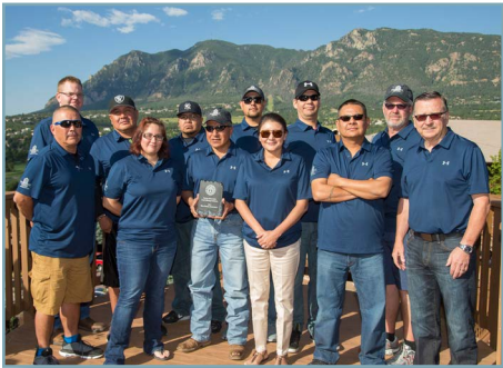
NACoal - Bisti Fuels