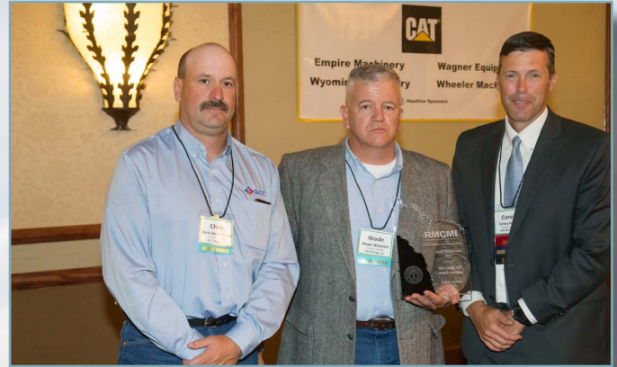
Small Underground Mine GCC Energy, LLC King II Coal Mine