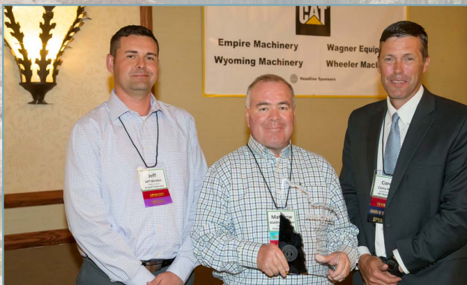
2017 Contractor Safety Award Rimpull Corporation