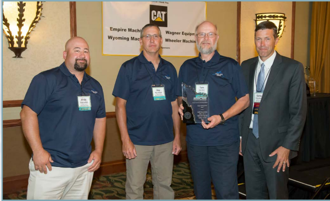
Large Underground Mine Bull Mountains Mine No 1 Signal Peak Energy LLC

RMCMCI was honored to present the following safety awards. These companies are recognized for outstanding safety practices for 2016. The awards are based on data received from MSHA and the number of man hours worked. Congratulations to these companies and the employees who strive to always put safety first.