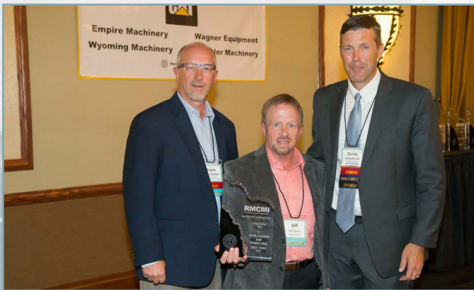
Large Surface Mine North American Coal Freedom Mine