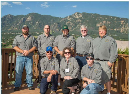
Western Energy - Rosebud Mine