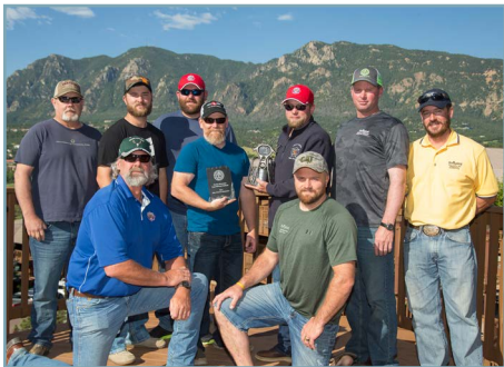
JR Simplot - Smoky Canyon