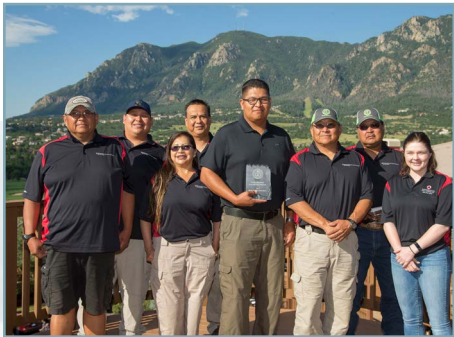
Westmoreland San Juan