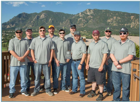
Falkirk Mining Co